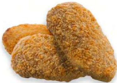
Green Jalapeños with Cream Cheese