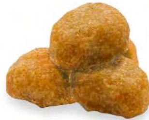
Cheese with Jalapeño Nuggets