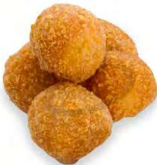
Paprinós (Breaded Cherry Pepper with Cream Cheese)