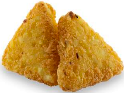
Hash brown Triangle