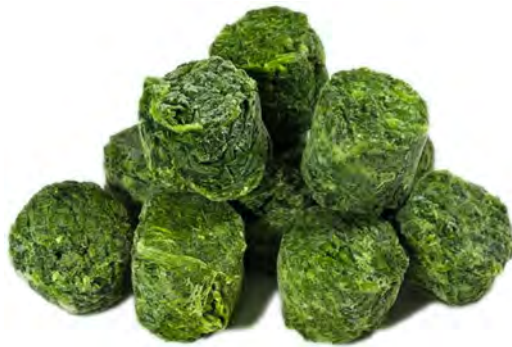
Spinach leaf portions