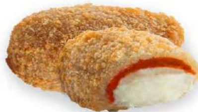
Red Jalapeños with Cream Cheese