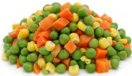
Variety of mixed vegetables