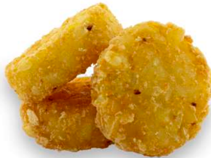
Hash brown Round