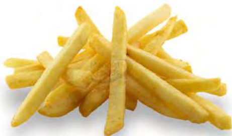
Coated Salted 7x7 / 10x10