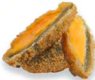
Green Jalapeños with Cheddar Cheese Mix

Our range of Mondelle appetizers completes the portfolio with finger foods for various foodservice solutions.