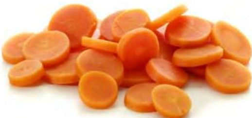
Variety of carrot cuts