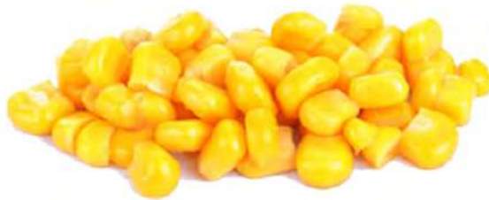
Sweet corn kernels