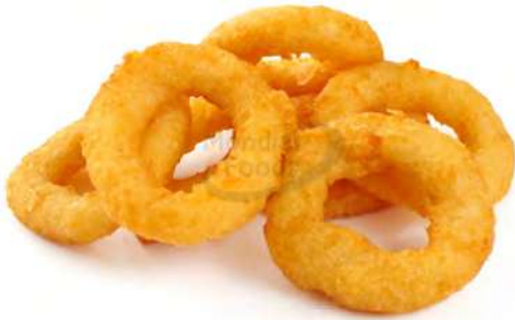
Crispy Onion Rings

Our range of Mondelle appetizers completes the portfolio with finger foods for various foodservice solutions.